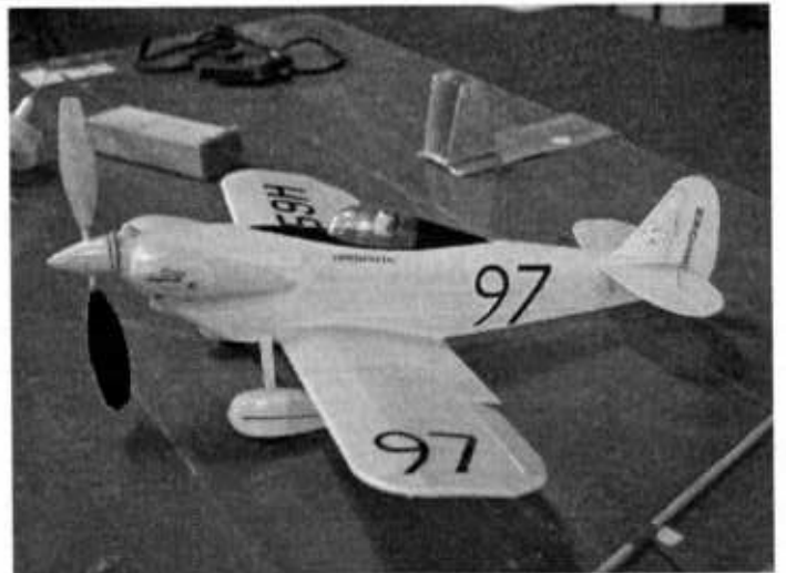
A. PETIT - F4F - Denight DDT