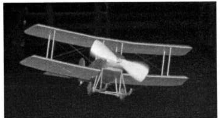
C. DAVID - F4F - Sopwith Tabloid