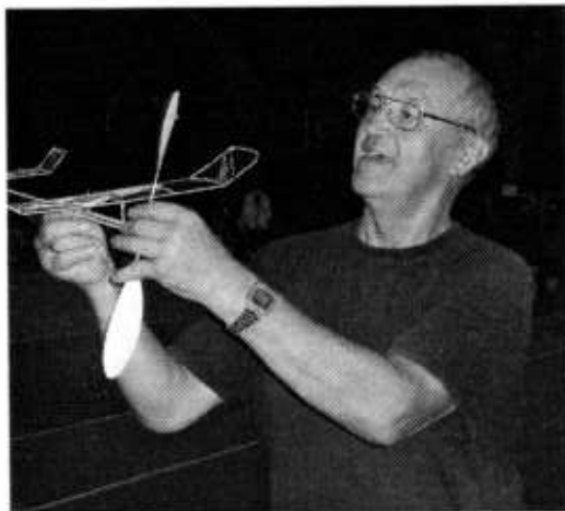
W. NIMPTSCH - FIL