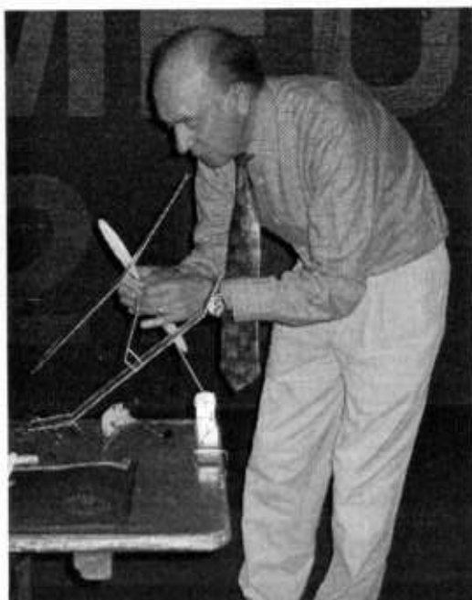
R. BOOR - FIL