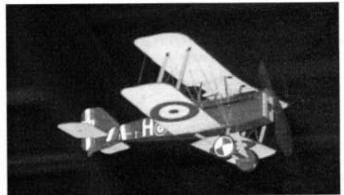
D. MASTERS - SE. 5a